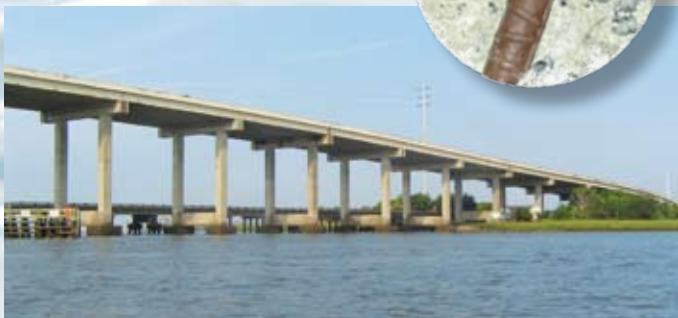
MacKay River Bridge near Brunswick, Georgia

Approximately twelve cores were extracted from each bridge. The effective diffusion coefficient, D , and surface chloride content, C_s , were calculated based on the chloride concentrations measured at various depths from these cores. Based on the chloride profiles, the chloride concentration at the depth of the steel was estimated. Both the effective diffusion coefficient and the surface chloride content typically decreased with increasing elevation and can be grouped into two zones: tidal zone (between low and high tide) and splash zone (0 to 5 ft. above high tide).