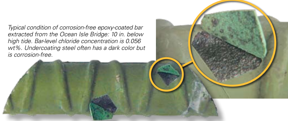
Typical condition of corrosion-free epoxy-coated bar extracted from the Ocean Isle Bridge: 10 in. below high tide. Bar-level chloride concentration is 0.056 wt%. Undercoating steel often has a dark color but is corrosion-free.

well above the threshold for uncoated bar (0.030 wt%). Using corrosion modeling, it was calculated that corrosion of uncoated bars would have initiated around 1989. As there was no observed concrete distress in 2006, it was concluded that the propagation time for damaged epoxy-coated bar in the tidal zone is greater than 17 years.