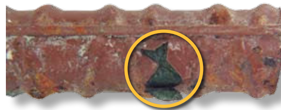
Poor adhesion of coating to steel for bar obtained from the MacKay River Bridge (tidal zone, bar-level chloride concentration is 0.251 wt%).

The full report titled "Condition Survey And Service Life Prediction Of Four Marine Bridge Substructures containing Epoxy-Coated Reinforcing Bars" is available from www.epoxyinterestgroup.org