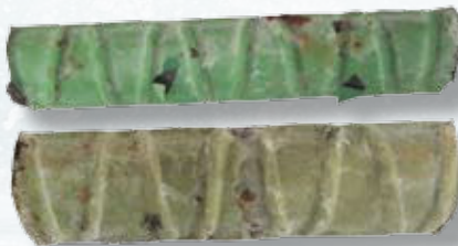
Two bars from the Ocean Isle Bridge show light corrosion: a) a horizontal No. 6 bar with a cover of 4.75 in. and bar-level chloride concentration of 0.199 wt%; b) a vertical No. 8 bar with a cover of 5.1 in. and bar-level chloride concentration of 0.183 wt%.

Active corrosion was observed on three epoxy-coated bar segments (one from the MacKay River Bridge and two from the Ocean Isle Bridge) that had significant coating damage (2 to 5%). This coating damage appears to have been present since construction. These bars were all located in the tidal zone and exposed to chloride concentrations (0.183 to 0.251 wt%)