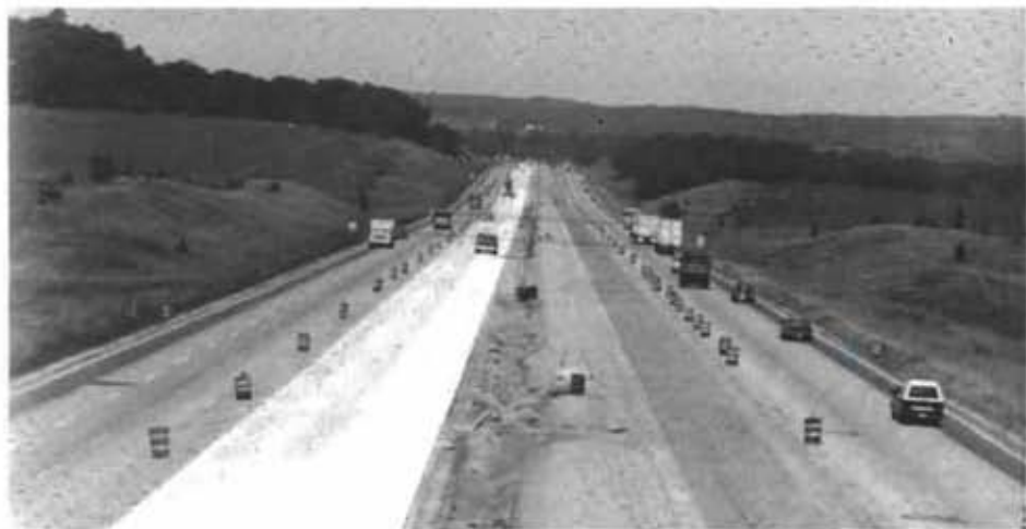
Traffic continued in 2 lanes while new 3rd lane and reconstructed dual lanes were done. Epoxy-coated rebar is in place on right inside lane.