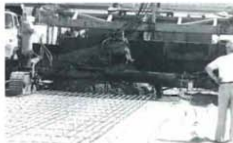
Spreading concrete over grade. Epoxy coated rebar was set on bar chairs for close placement control.

Epoxy-coated reinforcement specified. Wisely DOT design officials were not chancing future road problems with reuse of the old salt-saturated concrete. They specified fusion bonded epoxy-coating for all of the 1,540 tons of reinforcing steel to be used in this 200 lane mile project. Wisconsin prides itself on maintaining ice and snow free driving conditions. This has required heavy salting over the 23 winters since this interstate was constructed. This caused a level of chloride penetration in the old concrete that, when used as aggregate, could spell corrosion trouble for unprotected steel. Hence, the sure easy solution - epoxy coat the rebar. All of it!