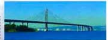
The new bridge concept