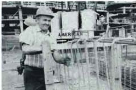
Assembling beam cage for clinic parking structure. Note flying form in photo above, a mark of an efficient job.

New plans were drawn up for a $10,000,000, seven level parking structure for 1,500 cars. Ceasar Pelli & Associates, New Haven, CT, architects and Barber & Hoffman, Inc., Cleveland engineers, teamed up with construction manager,